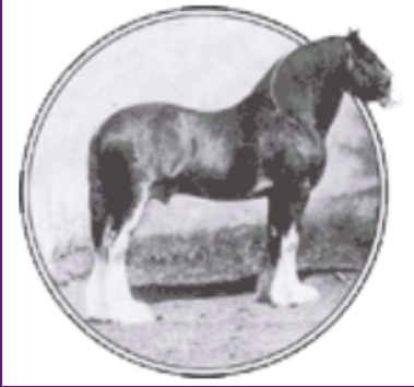
Clydesdale Horse Society of New Zealand