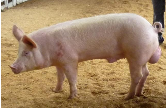
Intermediate Champion Best Pig All Breeds over 5 and under 8 months Large White Boar, Kerry Glen Boss shown by Paul Peck from Ashhurst

Sash kindly sponsored by Taranaki Pig Breeders