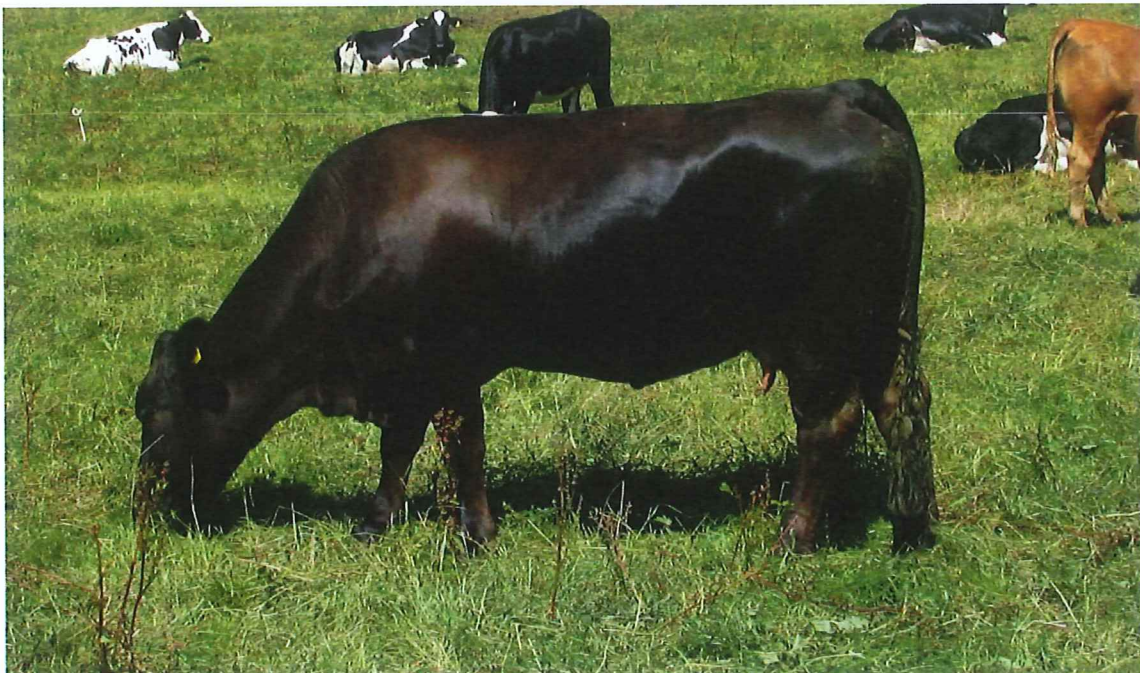
Champion Female 2017