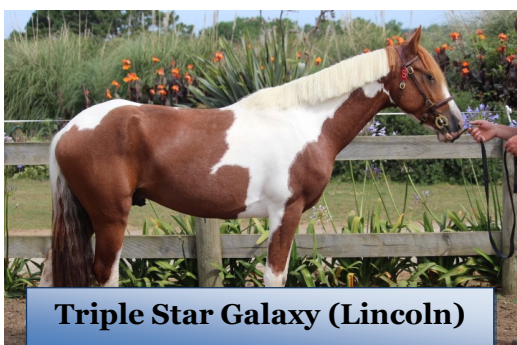
Triple Star Galaxy (Lincoln)