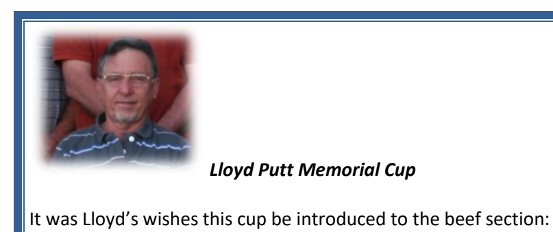
*** Lloyd Putt Memorial Cup PM $100

Points: 1^{st} 50, 2^{nd} 30, 3^{rd} 10, 4^{th} 5 Winner: To be awarded to the exhibitor with the points nearest to 67