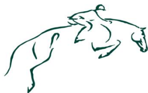
C O U N T Y S A D D L E R Y

Are you one of the many who always asks for covered yards, but never gets them? Have you checked out the fundraising scheme to help the NEC build the yards and provide you a guaranteed covered yard for 7 years? See the DOCUMENTS tab for more information. There are still some spaces left and what a great Christmas present to yourself.